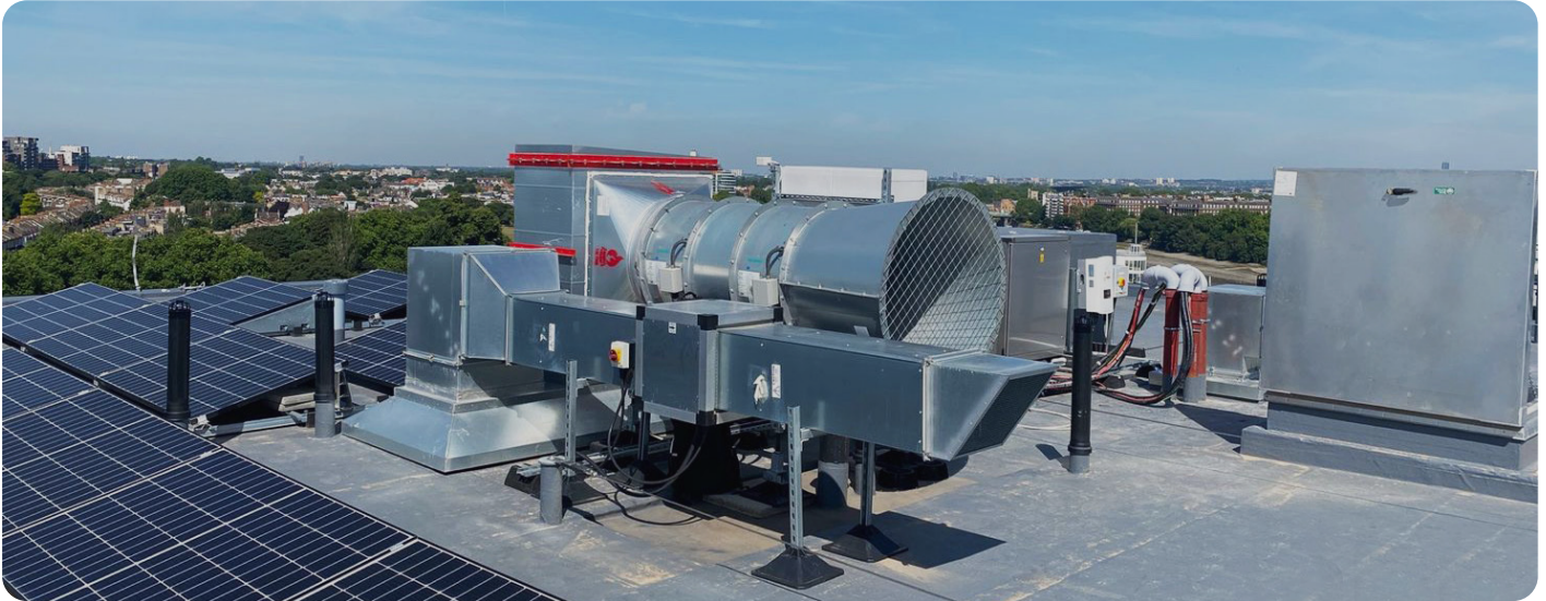
The Osiers Road, London, United Kingdom