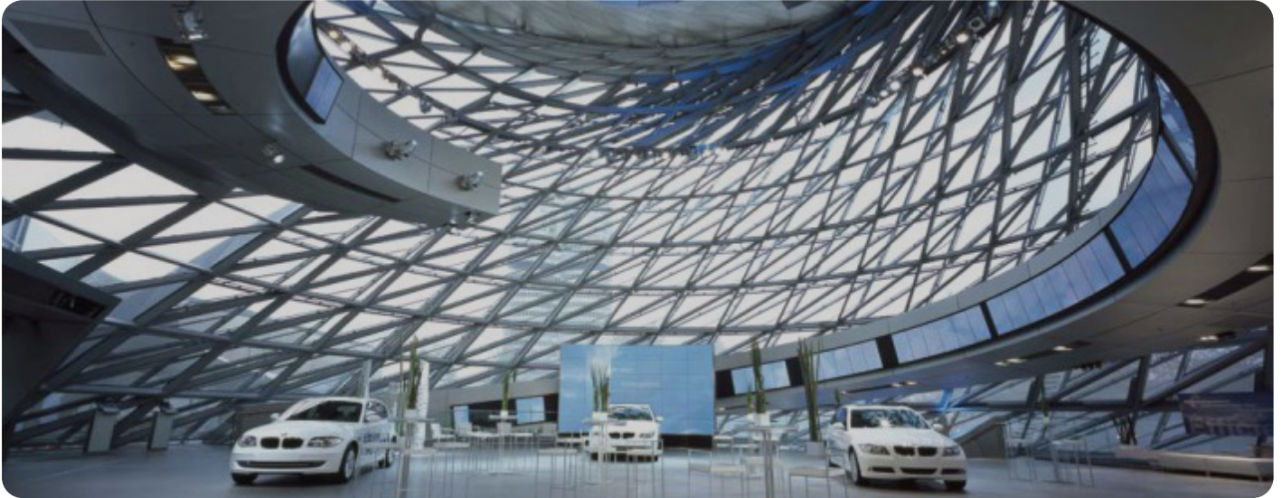
BMW Welt, Munich, Germany