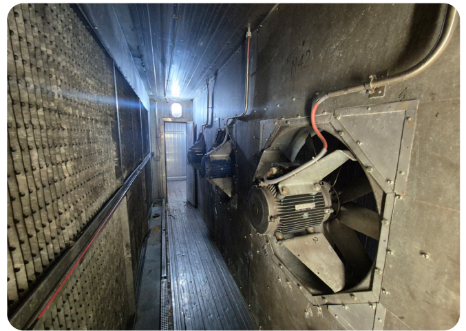
Previous installation - at Unilever Caivano

Although a visual site survey was possible, harsh conditions - including temperatures of -43^{\circ}\text{C} , outdated documentation, and limited access during production - made data collection difficult. By analyzing comparable fans in similar tunnels onsite, however, we were able to gather enough performance data to specify the optimal retrofit solution.