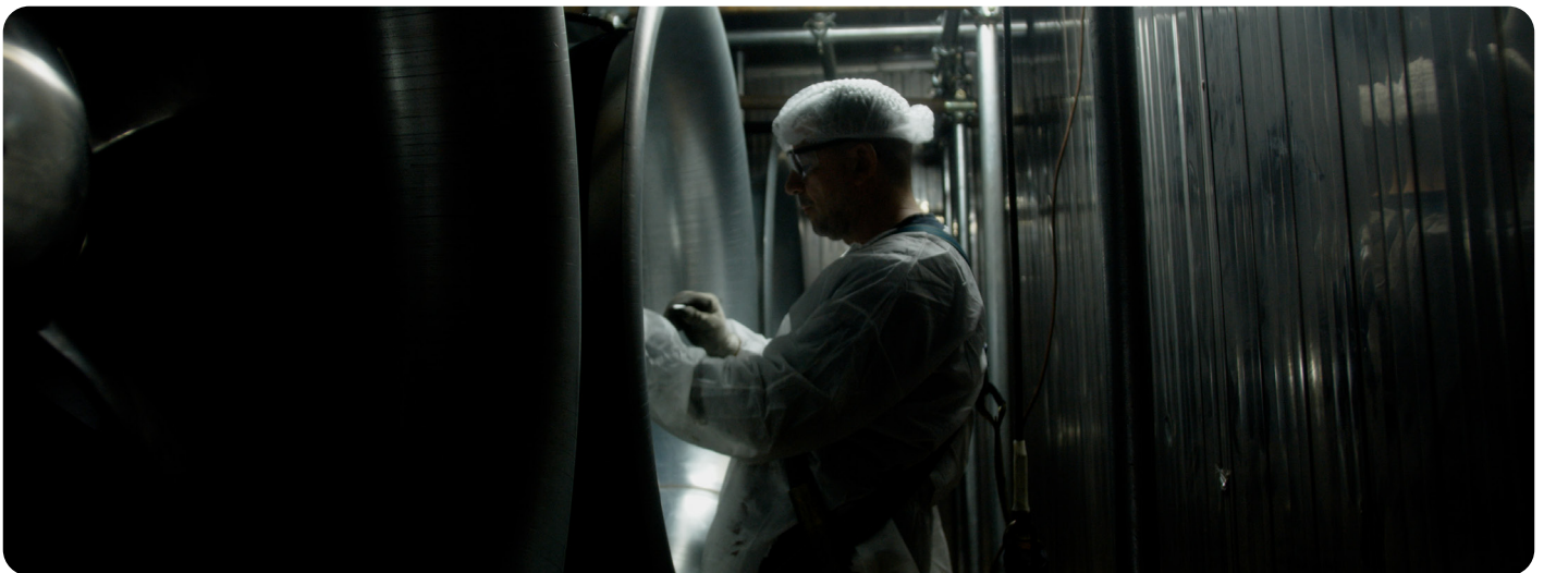
ZerAx fans in the ice cream tunnel, where extreme low temperatures demand maximum efficiency and reliability

This section summarizes the compliance standards and technical specifications for the Unilever Caivano site, including key performance data, system details, and relevant certifications to enable accurate evaluation and comparison