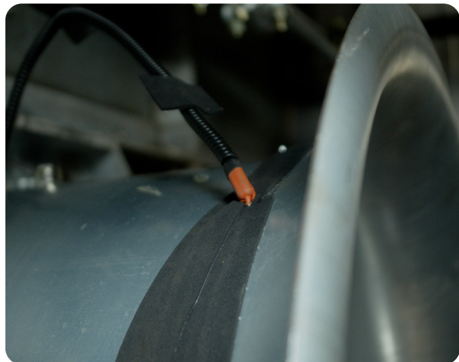
ZerAx with heating bands

The solution was to install 200 W heating bands around the rotor casing. These prevent frost buildup, ensuring the fans are ready to operate, even after weekly maintenance stops of the ice cream tunnel.