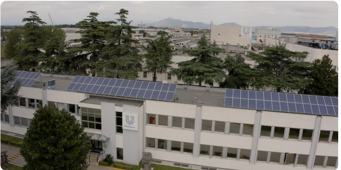
Unilever Caivano Site

Unilever, Danfoss, and NOVENCO Building & Industry joined forces to deliver efficient cooling and energy performance, key factors to Unilever's goal of zero emissions at the Caivano site by 2030.