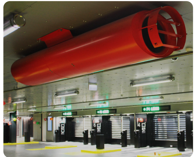
NOVENCO jet fan powder coated red

The area also features outdoor spaces, playgrounds, cafés and flexible rooms for work, exhibitions and research. BLOX EATS, operated by renowned restaurateur Meyer, offers casual food inspired by world cuisines.