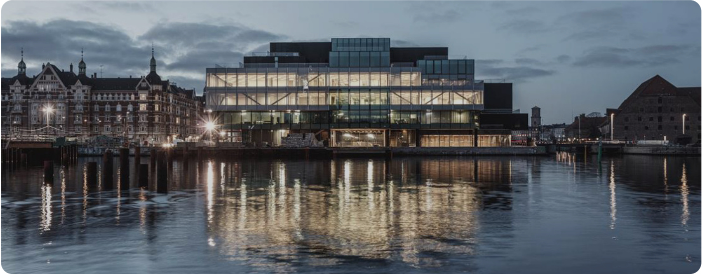
BLOX, Copenhagen, Denmark