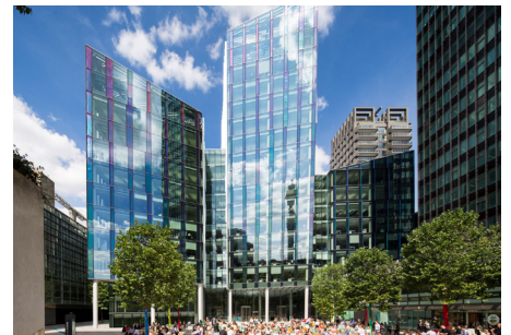
10 BROCK STREET (LONDON, UK)