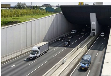
COENTUNNEL (AMSTERDAM, NETHERLANDS)