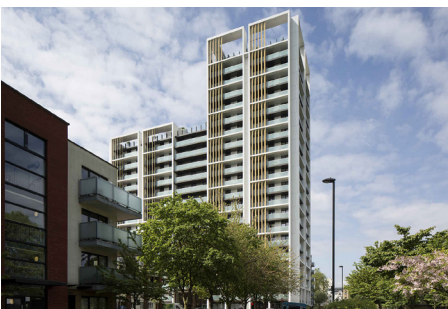
WAYLAND HOUSE (LONDON, UK)