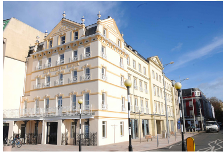
WEIGHBRIDGE HOUSE (JERSEY)