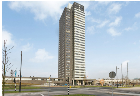
PORTHOS (EINDHOVEN, NETHERLANDS)