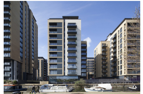
SUTTONS WHARF NORTH (LONDON, UK)