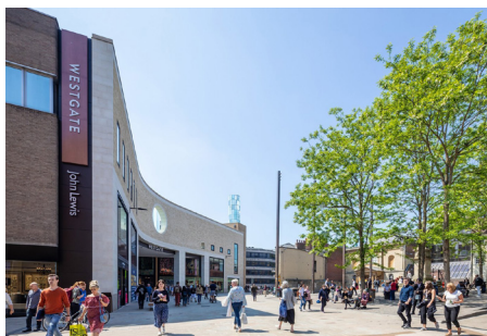
WESTGATE SHOPPING CENTRE (OXFORD, UK)