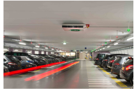
MUSEUMKWARTIER (DEN HAAG, NETHERLANDS)