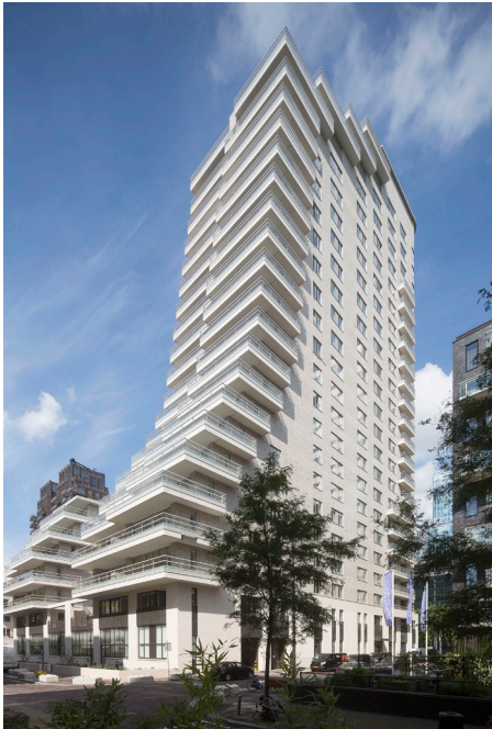
INTERMEZZO (AMSTERDAM, NETHERLANDS)