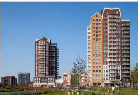
OOSTERHEEM (ZOETERMEER, NETHERLANDS)