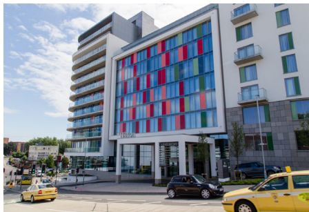
TERRACE MOUNT HILTON (BOURNEMOUTH, UK)