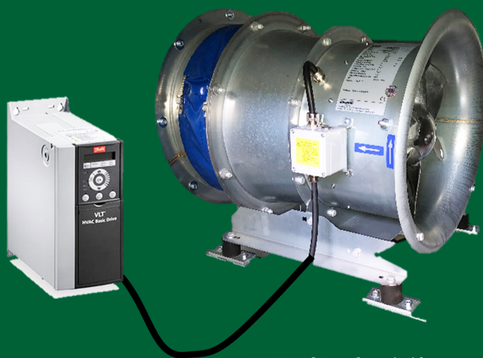
NOVENCO® ZerAx® stocked fan