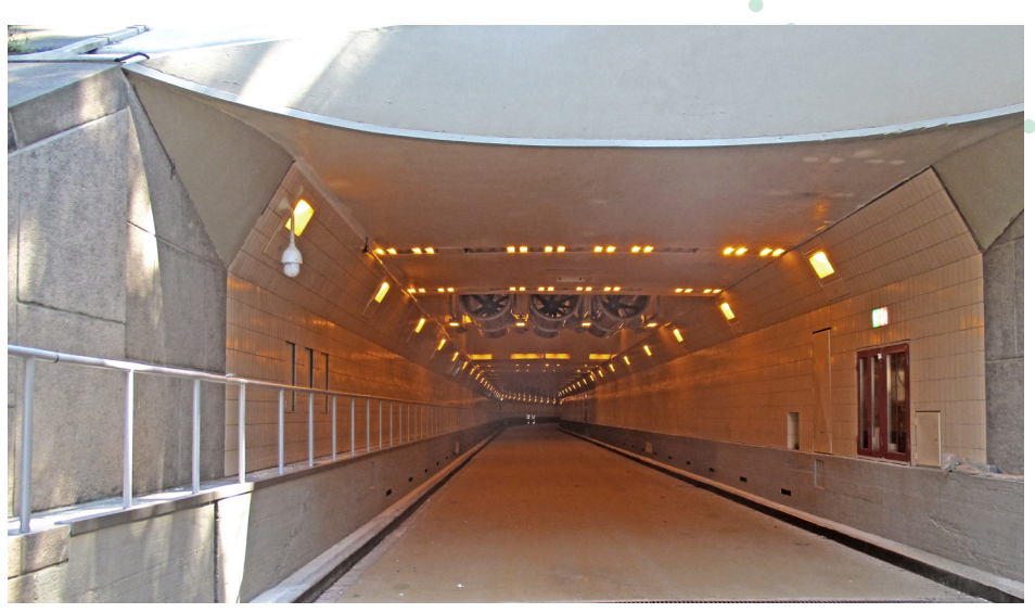
One of the Maastunnel entrances