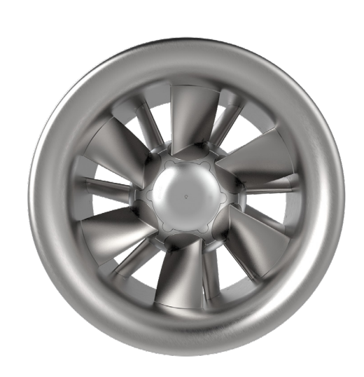
Highly efficient NOVENCO® ZerAx® axial fan

was a further contributing factor for choosing the up-to-date and the most efficient fan in the world, the NOVENCO® ZerAx® fan.