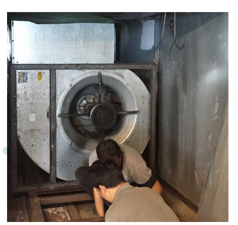
Before retrofit - cetrifugal fan