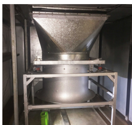
After retrofit - NOVENCO ZerAx EC+