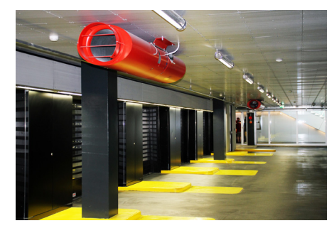
NOVENCO jet fan powder coated red