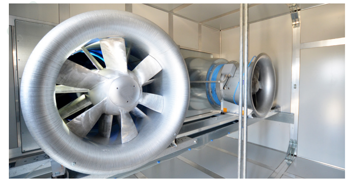
NOVENCO ZerAx®axial fans in parallel operation

The Volkswagen Group assumes daily responsibility for the environment, whereby emissions receive special attention. Through innovation and impressive planning, the goal is to continuously reduce energy consumption and {\rm CO_2} -emissions. For this strategic interest, the new device technology with ZerAx fans fits perfectly.