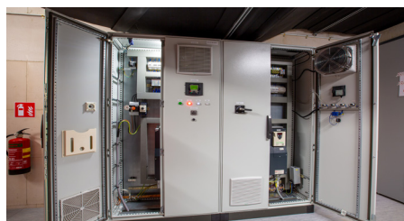
One of the control panels for the escape tunnel pressurization system