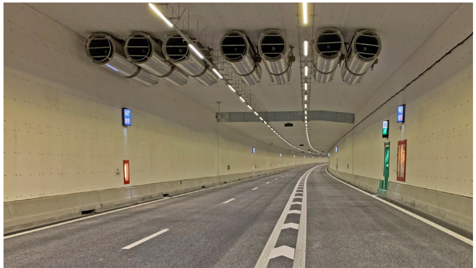
NOVENCO reversible tunnel jet fans in the Gaasperdammertunnel