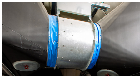
ZerAx® axial pressurization fans ensure smoke free escape routes