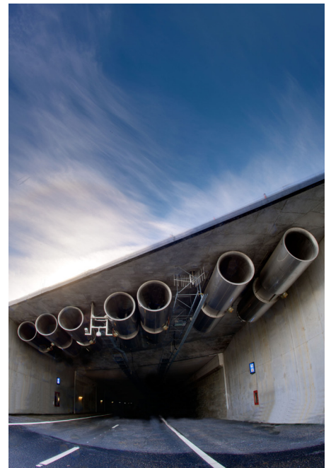
A2 LEIDSCHERIJN (UTRECHT, NETHERLANDS)