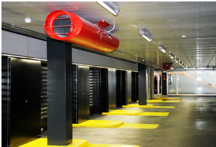
NOVENCO jet fan powder coated red