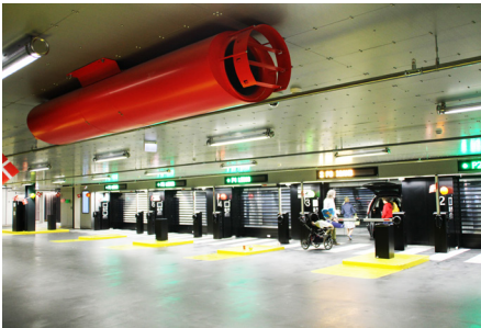
NOVENCO jet fans type AUO 380 assure fresh air