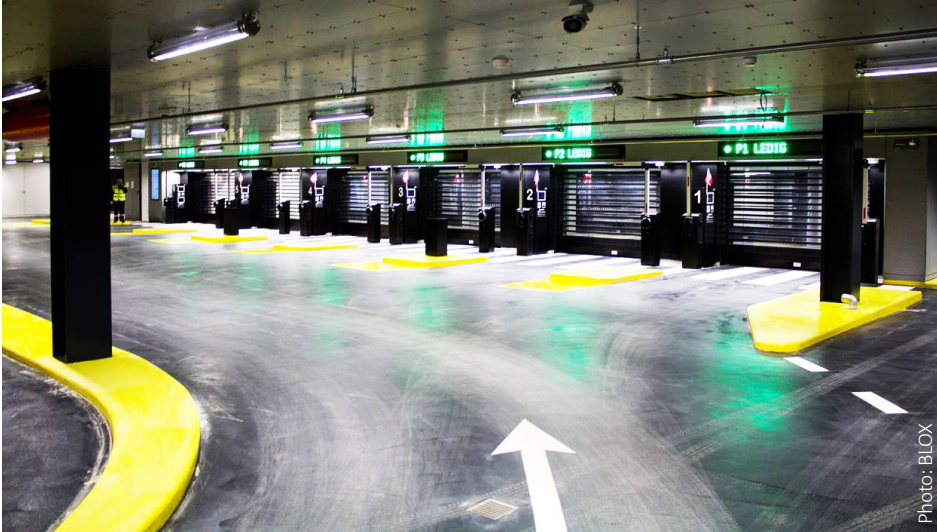
Car park entrance with automated lifts

Moreover, for stable air exhaust for the whole building, a total of 21 pcs of NovAx ACN axial flow fans in different sizes were also delivered